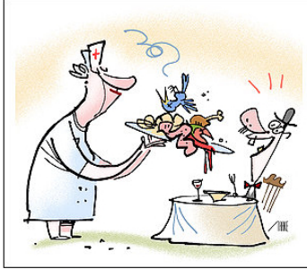
(Bob Staake for The Washington Post)

Congress A hospital A Wall Street investment house McDonald's Match.com The Kohler bathroom fixture company A sperm bank A college English department Microsoft The Redskins